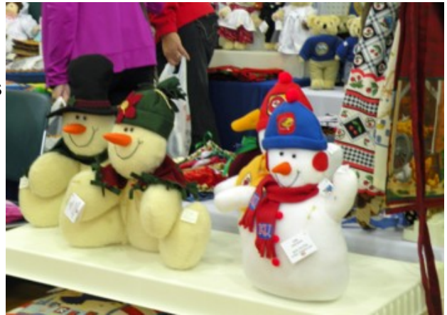
The annual Arts and Crafts show helps persons get ready for the Holiday Season.